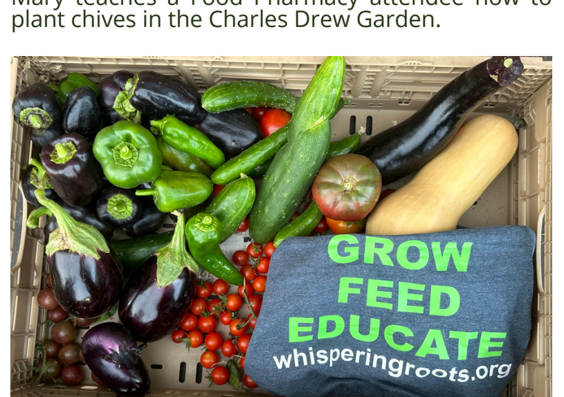
Produce haul from a day in the gardens! This produce was used for culinary class and our Whispering Roots Meal Program.