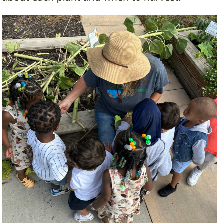
Kids at Gateway Early Learning Center taste, touch, smell, and explore in the Sensory Garden.